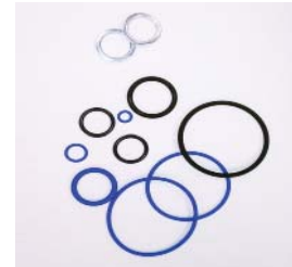
Garrett TPE-331-100 HR Kit Part Number: AL-331-100