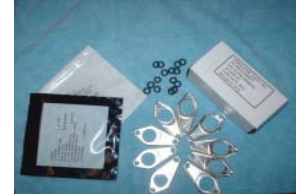
300 HR Inspection Kit - Bell 206 Part Number: AL-B206-300