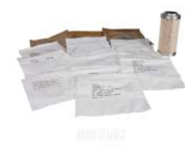
PT6 100 HR Kit Part Number: AL-PT6-100FW