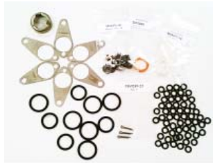
PT6 (Pratt) Hot Section Kit Part Number: 3028555

AvLab offers a large array of inspection kits for every type of rotor and fixed wing aircraft. Choose from our top sellers below or customize your very own inspection kit according to your unique needs. For more inspection kit options or to customize your own kit, contact a representative at 713-864-667 / 800-256-6876 or sales@avlab.com.