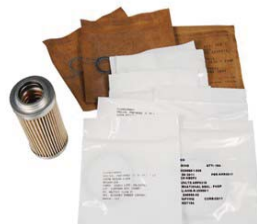
250/C20 100 HR Kit Part Number: AL-AGT-250 PT6 100 HR Inspection Kit Part Numbers: AL-PT6-100