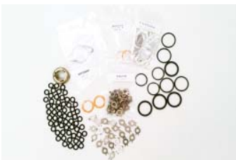
Hot Section Kit Part Number: AL-HS-KIT