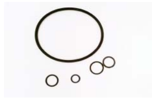
TFE-731 150 HR Kit Part Number: AL-731-150