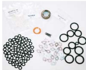
PT6 O-Ring Kit Part Number: 3034888-AL