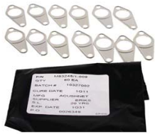
300 HR Inspection Kit for 331 Part Number: AL-331-300