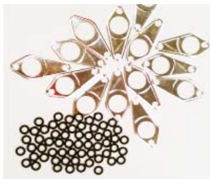
Bell 206 100 HR Kit Part Number: AL-B206-100