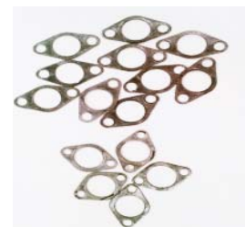
Bell 206 100 HR Kit Part Number: AL-B206-100