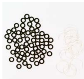
Bell 206 100 HR Kit Part Number: AL-B206-100