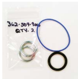
731-300 HR Kit Part Number: AL-731-300