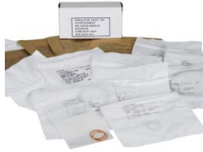
PT6 100 HR Inspection Kit Part Number: AL-PT6-100FW