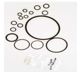
Bell 206 100 HR Kit Part Number: AL-B206-100